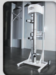
EVO Waterborne Flash-Off Systems