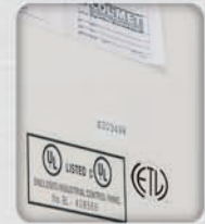
UL & ETL LISTINGS

DOUBLE-WALL FRONTAL Frontal walls are constructed of double-sided, 20-gauge, premium quality galvanized steel, with 2" of insulation and powder-coated white on both sides.