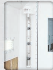
VS Waterborne Flash-Off Systems (variable speed)